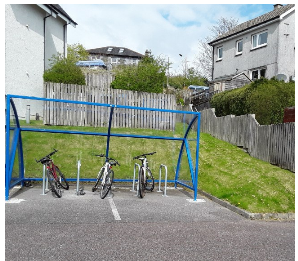
Bike shed at MacMillan Court, Ardrishaig, funded by ACHA improvements programme

To discuss your suggestions for making your area a better place to live, please get in touch with your local housing team.