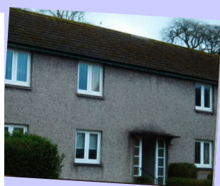
Glebelands, Rothesay ▲ ▼