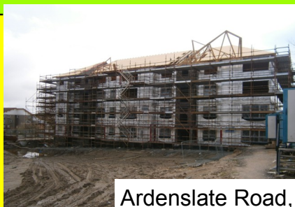
Ardenslate Road, Dunoon

ACHA has three sites currently underway for new housing, Park Square in Campbeltown - 32 homes which should be ready in April next year, Ardenslate Road in Dunoon - 24 homes which should be ready by The end of this year and Scott Terrace, Dalmally - 8 homes which are scheduled to be completed by June next year.