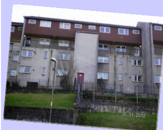
Soroba, Oban ▲ ▼