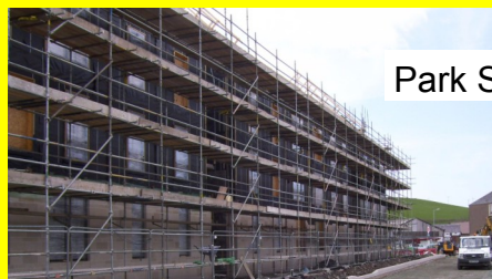
Park Square, Campbeltown