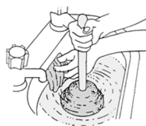
Clearing a blocked waste pipe

If you report this as a repair you may be charged for unblocking it.