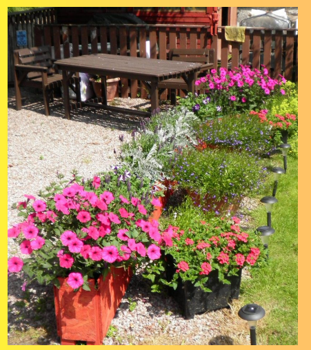
One of the winners in Mid Argyll last year

Registered with the Office of the Scottish Charity Regulator, charity number SC042713