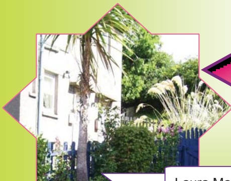
Laura MacGregor Bute

Some of the winners and gardens from the 2010 Garden Competition. Well done to everyone!