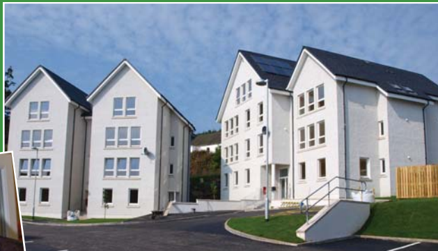
MacMillan Court, Ardrishaig

The new flats have solar powered water heaters and two of the ground floor flats are designed with full disability access. This contract provided employment for 58 tradesmen and 6 apprentices.