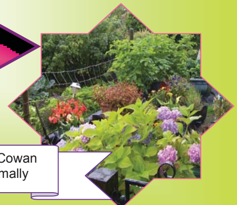
Mrs Cowan Dalmally

Some of the winners and gardens from the 2010 Garden Competition. Well done to everyone!