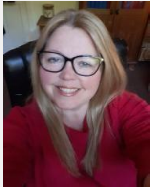
Bute & Cowal Bute Advice Centre 01700 502784 info@buteadvice.org.uk