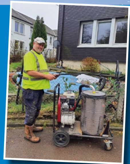
AHFA gutter-cleaning operative out-and-about on ACHA's estates

Your local Housing and Neighbourhood Services and Property Services team will be carrying out a series of estate walkabouts over the coming months.