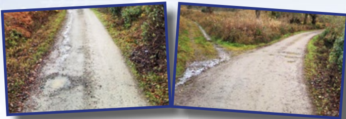
Before (above) and after photos of the access track

After years of being plagued with pesky potholes on the access track to the Travelling Persons site and cottages at Duncholgan, residents are pleased that Argyll Community Housing Association (ACHA) and Argyll and Bute Council have come together to fund a tarmac surface for their road.