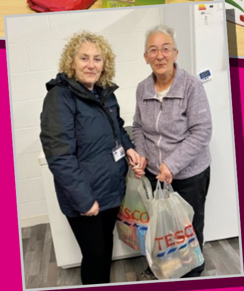
Pictured above are staff from our Oban office, who made donations to the local food bank.