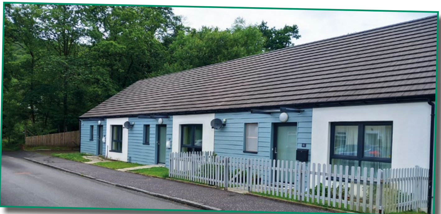
Linn Walk, Garelochhead

Information on future walkabouts can be found on our website – www.acha.co.uk/services-estate-management/ .