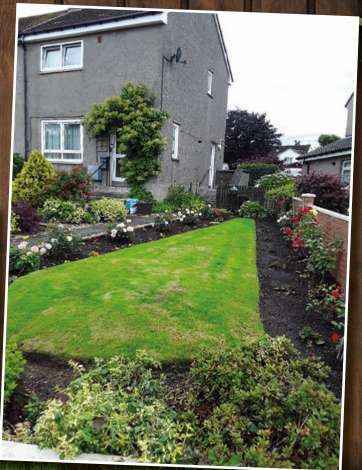
2 nd place – 44 Kirkton Road, Cardross