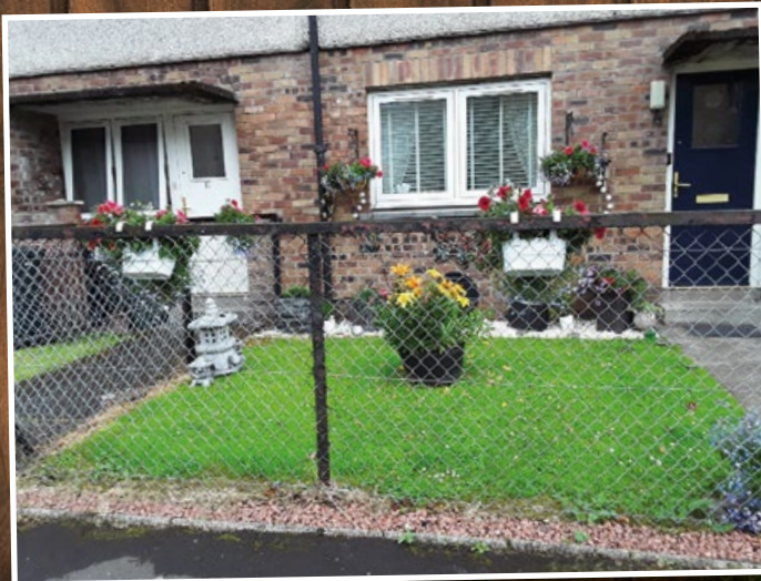
1 st Place – 8 Nursery Street, Helensburgh