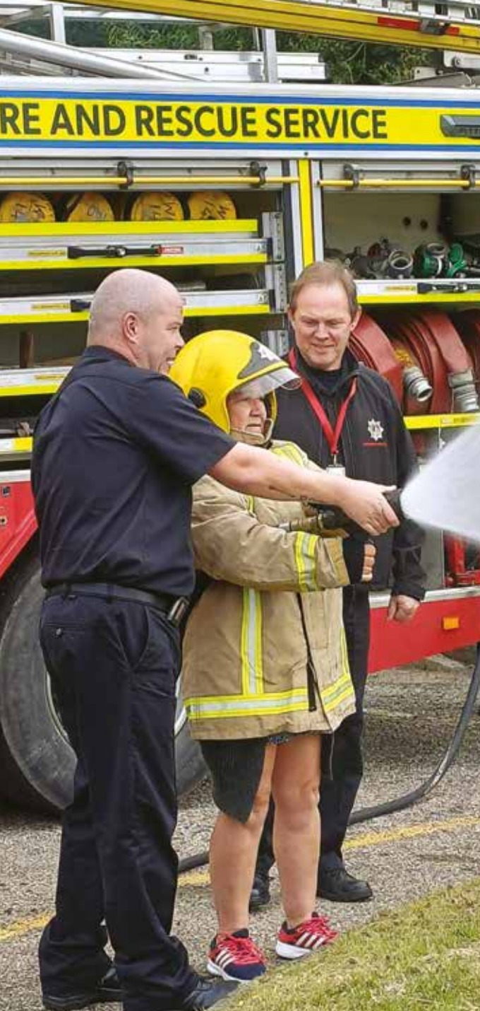
Community event at our travelling persons site at Duncholgan in partnership with MECOPP (minority ethnic carers of people project) and Fire Service.